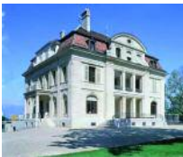
The Inter-Parliamentary Union building

"The true importance of the IPU lies not so much in passing resolutions as in its function as a forum for parliamentarians to establish contacts with one another and network."