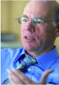
Dr Norbert Lammert, President of the Bundestag

"The true importance of the IPU lies not so much in passing resolutions as in its function as a forum for parliamentarians to establish contacts with one another and network."