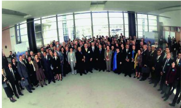
The annual plenary session of the Euro-Mediterranean Parliamentary Assembly in Brussels in 2006 with President Josip Borrell

The "Barcelona Process" launched in 1995 is particularly important for the partnership between the Mediterranean region and Europe. This process stands for cooperation between the EU and the Mediterranean countries on an equal footing in the areas of politics and security, economic affairs and social, cultural and human affairs. In 2010, this cooperation is to lead to a Euro-Mediterranean Free Trade Area. The countries involved include Algeria, the Autonomous Palestinian Territories, Egypt, Israel, Jordan, Lebanon, Libya, Morocco, Syria and Tunisia. With some of these states, the EU had already concluded association, partnership or cooperation agreements. The long-term goal is to create a zone of prosperity and stability in the Mediterranean region.