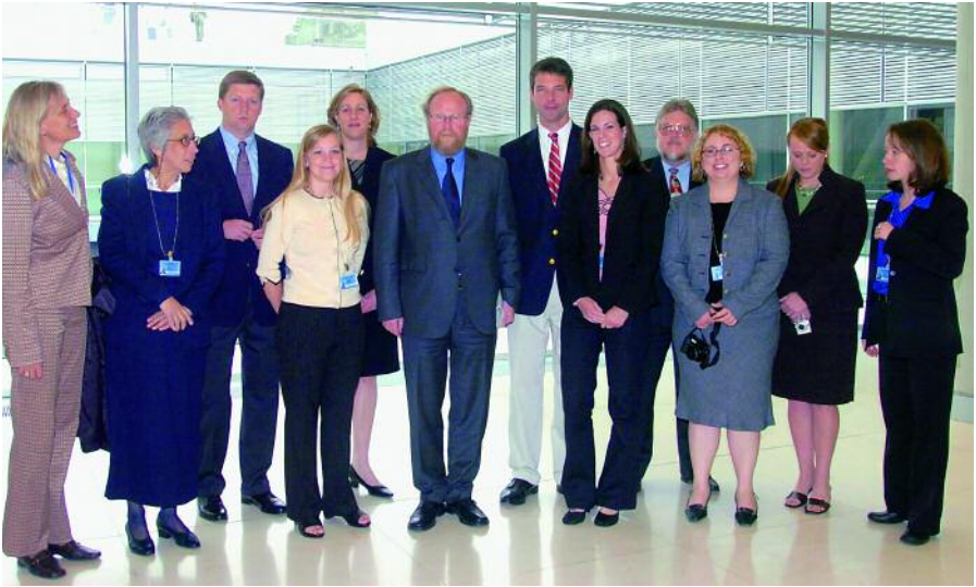
Vice-President of the Bundestag Dr h.c. Wolfgang Thierse meets staff from the US Congress during a staff exchange visit to the Bundestag.