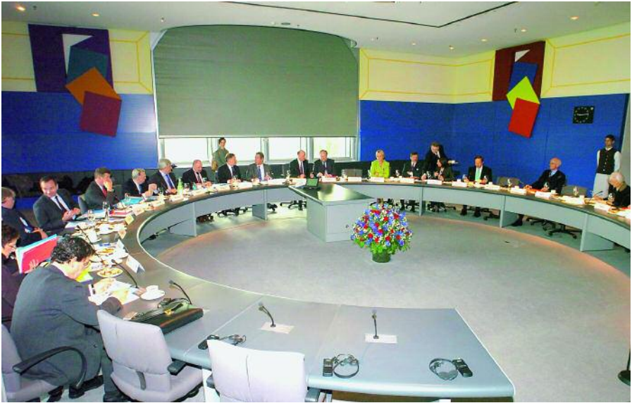
Joint session of the members of the Presidiums of the German Bundestag and the Assemblée nationale with President of the Assemblée nationale Jean-Louis Debré and President of the Bundestag Dr Norbert Lammert.

foreigners a thorough insight into the core area of our national sovereignty.