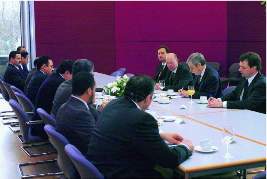
President of the Bundestag Dr Norbert Lammert receives a delegation from the Consultative Council of the Kingdom of Saudi Arabia.

seen to challenge their international policy, but on many occasions they benefit from such contacts – particularly, for example, when they want to put a message across but the normal “diplomatic channels” are blocked. At the time when many Arab states were establishing relations with the German Democratic Republic during the 1960s and the Federal Government broke off relations with these countries in line with its political doctrine of the time, it was the parliamentarians who maintained contact with the Arab world.