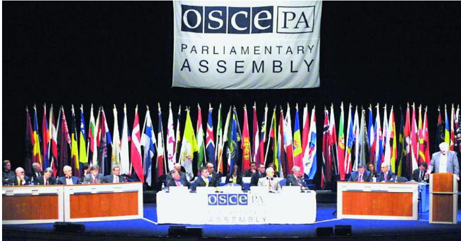
Annual session of the Parliamentary Assembly of the OSCE

quently began to deploy missions to potential crisis spots in Europe and the Caucasus. In 1995 the CSCE was renamed the “Organisation for Security and Cooperation in Europe” (OSCE). It maintains various field missions, providing practical assistance as regards conflict prevention and management. These missions