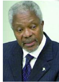
UN Secretary-General Kofi Annan addressing the Bundestag in February 2002

The IPU’s very format means that it is designed to tackle global problems: the international financial order, AIDS, terrorism and many other issues. The IPU deliberates on such issues, adopting resolutions and producing reports on them. Naturally, these resolutions lack the binding character of resolutions adopted by the UN Security Council, for example. Yet they are intended to encourage national parliaments to adopt resolutions themselves. The IPU often deals with new topics, such as the internet or genetic engineering, earlier than do some national parliaments, and is thus able to provide some guidance. President of the Bundestag Dr Norbert Lammert, who heads the German delegation to the IPU, believes that the IPU’s real importance lies not in passing resolutions, of which he says, “the impact is exhausted at the latest when they are adopted”, but rather in its function as a forum for parliamentarians to