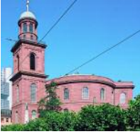
St Paul's Church in Frankfurt.

Some dictatorships allow parliaments to exist in order to disguise where the true power lies. How should democrats behave towards them? Should they make use of the limited powers that such a parliament has – or have nothing to do with it on the grounds that it is only a sham? The concept of the immunity of parliamentarians from prosecution is still foreign to many countries, where members of parliament run the risk of being punished for representing the interests of their voters.