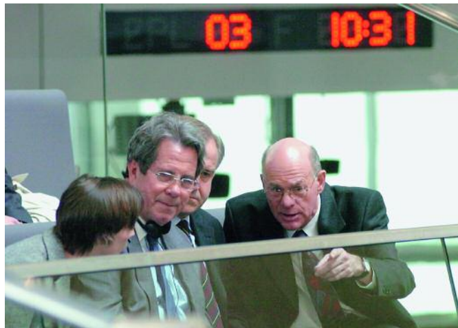
The President of the Assemblée nationale, Jean-Louis Debré, and his German counterpart, Dr Norbert Lamert, during a plenary sitting of the German Bundestag.

Even if they do not have repercussions at national level, however, international relations are too close and too important to be left to governments alone. History shows that in institutional terms governments act at intergovernmental level. In situations where governments have reached an impasse, parliamentarians can take a far more nuanced approach and still maintain or even forge new relations to help the cause of peace. There have been many occasions when a meeting between parliamentarians has been instrumental in easing tensions. If two governments are in dispute, the chances of reaching political agreement are greater if the two countries have a mutual interest in and good knowledge of each other's political system and country at parliamentary level. Governments might sometimes disapprove for fear such encounters are