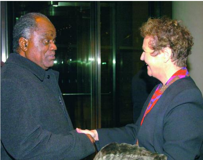
The Chair of the Parliamentary Friendship Group for Relations with the SADC States, Herta Däubler-Gmelin, welcomes the Namibian President of State Hifikepunye Pohamba.

Parliamentary friendship groups are entitled to visit the partner country or region concerned once per electoral term