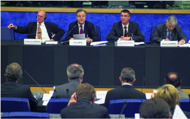
The Paris-Berlin colloquium staged by the German-French Parliamentary Friendship Group on "The role of the German-French partnership in the enlarged Europe".

result of the Iraq war, the German-US Parliamentary Friendship Group invited the US Congress Study Group on Germany to attend the annual meeting, to discuss the differences of opinion which existed. This was despite the fact that many bilateral contacts had been put on hold at that time. Parliamentarians can also, incidentally, cultivate ties with territories not recognised as states, such as Taiwan. As far as the Federal Government is concerned, there is only one Chinese state; it therefore has no official contacts with Taiwan. The Bundestag, on the other hand, has a Berlin-Taipei Parliamentary Circle of Friends, which allows the exchange of opinions and information at parliamentary level.