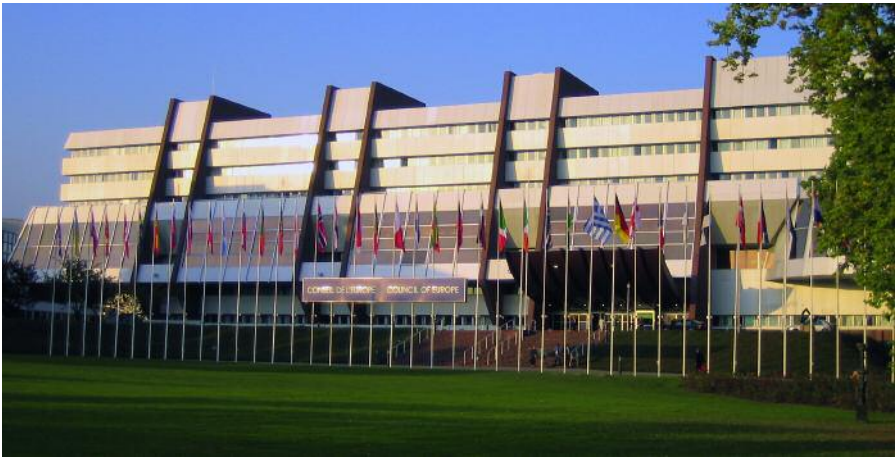
The Council of Europe building in Strasbourg

which was and still is responsible for spreading and monitoring these values. Resolutions on such questions as tackling internet websites which incite violence or the issue of assisted dying influence national legislation in many member states. Strasbourg parliamentarians often complain that their work receives little attention in the public arena, whereas any meeting of heads of government, even if purely ceremonial, will always be dutifully reported in all the newspapers.