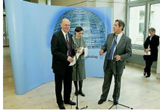
An interpreter in action at a meeting between President of the Bundestag Dr Norbert Lammert and his French counterpart, Jean-Louis Debré.

Increasing numbers of parliamentarians speak and understand English well, both Germans and their foreign colleagues – the primary conference language is becoming the worldwide lingua franca. But the Bun-