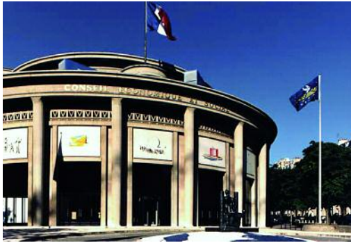
The seat of the Assembly of the WEU in Paris

This was also true in the field of security policy: in 1954 the Germans, together with the Western Europeans, concluded the modified Brussels Treaty. The central clause of this treaty, Article V, contains a commitment to mutual defence in the event of an external attack. The French government originally wanted to push integration far further and merge the Western European armed forces, including the future German forces, in a very close association: a European Defence Community (EDC). However, this was blocked by the French Assemblée nationale. The modified Brussels Treaty and hence the WEU as it is today were created in the aftermath, as there was a determination to at least retain a mutual defence commitment despite the failure of the EDC project. The new organisation was not given a military role. It was Nato, with the USA as its dominant member, which finally integrated the new Germany into the Western defence structures in 1955.