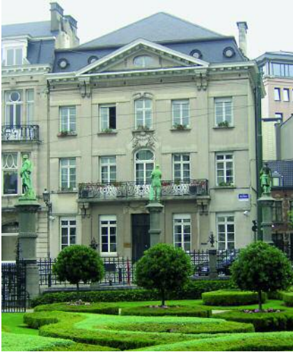
The offices of the Nato Parliamentary Assembly

mentarians travelled to Moscow to visit the Supreme Soviet. It would be fundamentally wrong, however, to perceive the Parliamentary Assembly purely as the Nato Council's support troops. In 1999 there were fierce debates among the security policymakers in the Assembly over the war in Kosovo. The Iraq war, too, provoked heated arguments among the delegates in 2003, while the Nato Council steered clear of the topic.