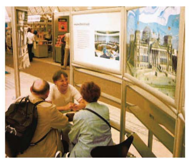
Bürgersprechstunden auf Messen

For understandable reasons, the Petitions Committee does not respond to anonymous or insulting letters.