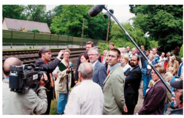
Der Petitionsausschuss bei einem Ortstermin in Verden-Dauelsen

The Petitions Committee has various options when it seeks to comprehensively clarify the facts of a case. It can: