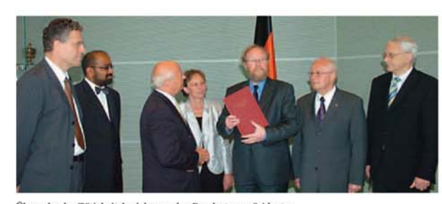
Übergabe des Tätigkeitsberichts an den Bundestagspräsidenten

In other cases, it is necessary for the Committee to facilitate complex proceedings during which all parties can be heard (e.g. when making on-site visits). Frequently, ways of finding a solution become apparent to those concerned during this process. Against this background, it is to be noted that in previous years it has been possible to achieve something for the petitioner in almost half of all cases. This may not always be the solution originally requested by the petitioner, but often a compromise that is regarded as acceptable by all the