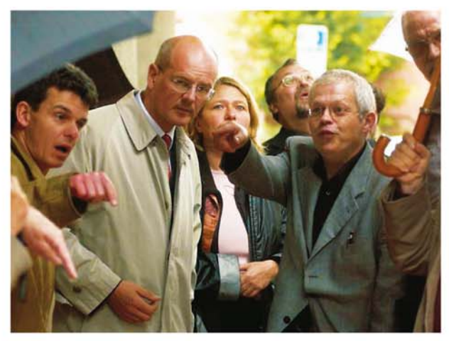
Der Petitionsausschuss bei einem Ortstermin in Castrop-Rauxel