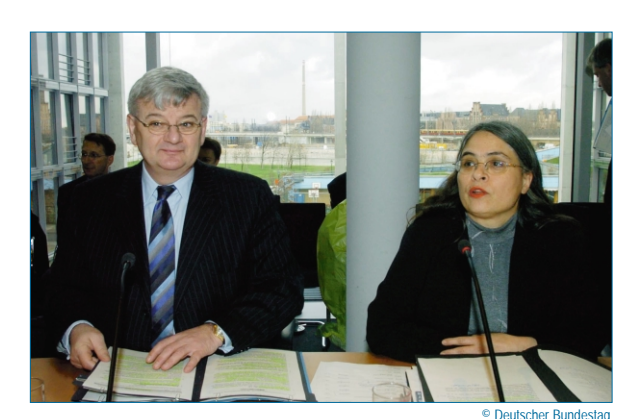
Foreign Minister Joschka Fischer and Christa Nickels

"It is important that we preserve the key objective of this committee: to take the side of human rights. In fulfilling this commitment we continue to tread an uncomfortable path, because credible human rights policy also begins at home. We must ensure, for example, that meticulous attention is paid to human rights in Germany and Europe in the fight against terrorism."