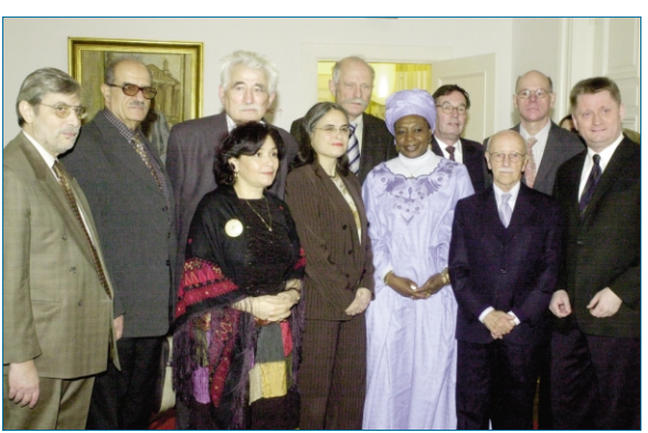
Hearing on the protection of human rights defenders