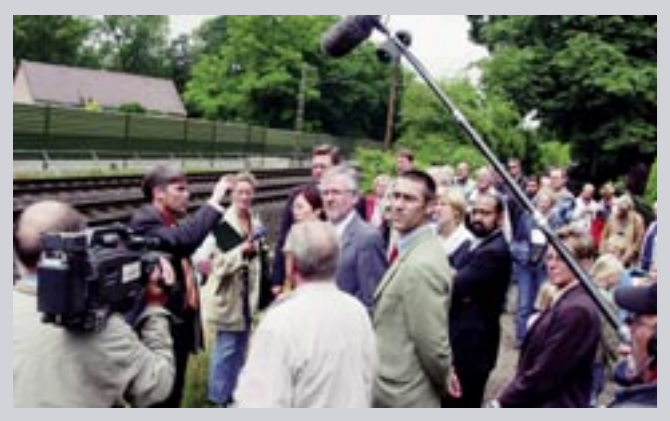
The Petitions Committee during an on-site visit to Verden-Dauelsen

The Petitions Committee has various options when it seeks to comprehensively clarify the facts of a case.