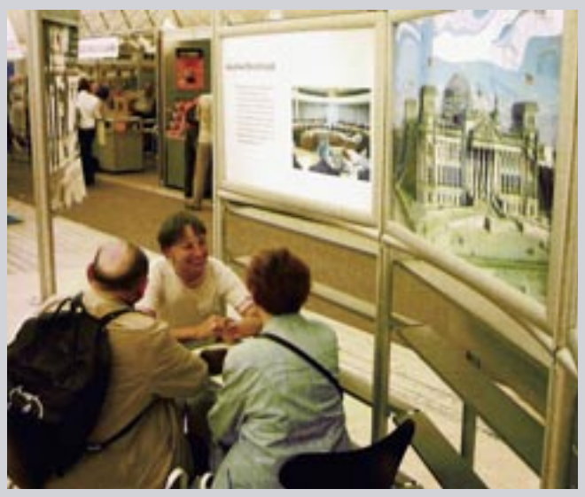
Meeting the public at trade fairs

For understandable reasons, the Petitions Committee does not deal with anonymous or insulting letters.