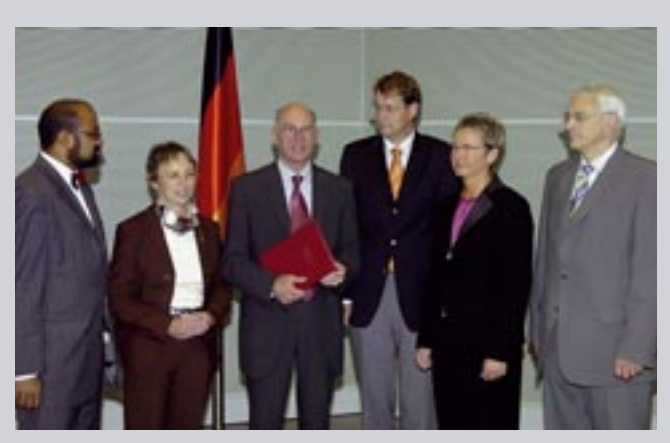
The report on the Committee's work is presented to the Bundestag President

other cases, it is necessary for the Committee to facilitate complex proceedings during which all parties can be heard (e.g. when making on-site visits). Frequently, ways of finding a solution become apparent to those concerned during this process. Against this background, it is to be noted that in previous years it has been possible to achieve something for the petitioner in almost half of all cases. This may not always be the solution originally requested by the petitioner, but often a compromise that is regarded as acceptable by all the parties.