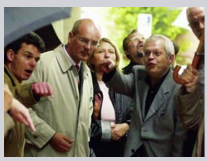
The Petitions Committee during an on-site visit to Castrop-Rauxel