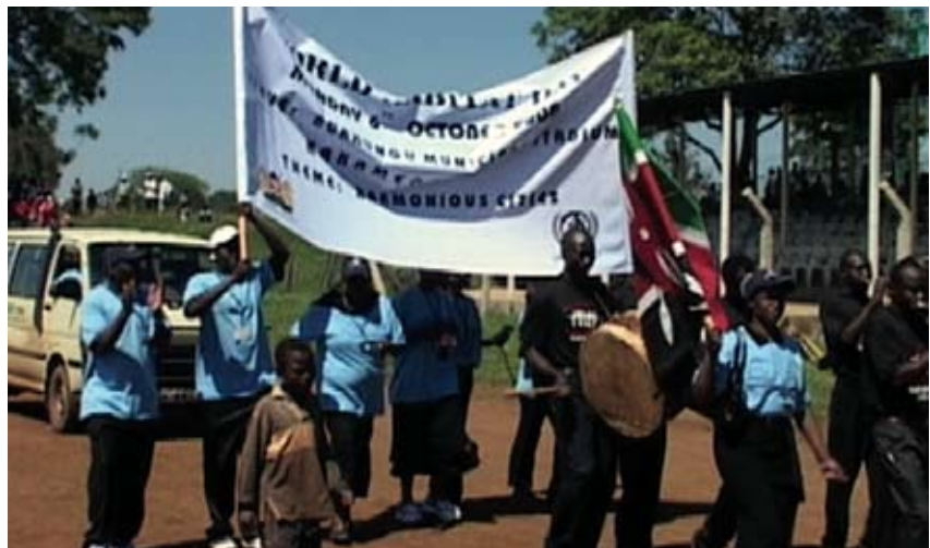
World Habitat Day celebrations in Tanzania.