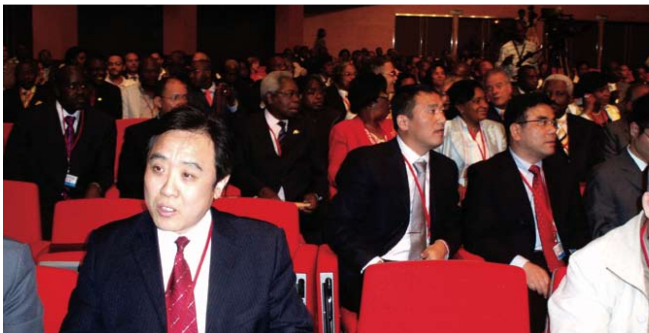
Participants at the World Habitat Day global celebrations in Luanda, Angola.