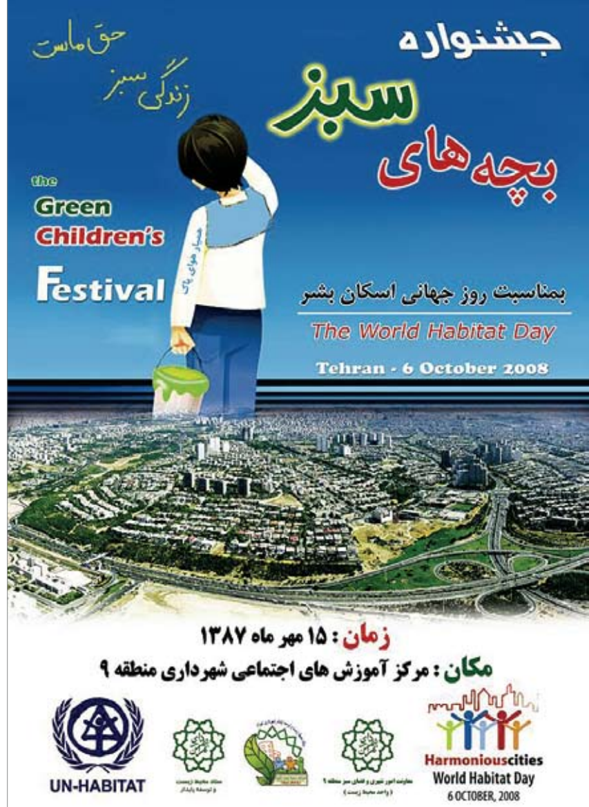
World Habitat Day celebrations in Tehran, Iran.

The second event organised by UN-HABITAT Brussels Office was the European celebration commemorating World Habitat Day at the UN House in Brussels, supported by the Embassy of the Republic of Angola in Belgium. Statements of UN Secretary General Ban Ki-moon and UN-HABITAT Executive Director Mrs. Anna Tibaijuka were delivered. Attending and speaking at both events were Ambassadors, members of European Parliament, representatives of the European Commission, Civil Society and local and international journalists, some of whom spoke on the global and European challenges of sustainable urban development and solutions adapted to harmonious urban development in our towns and cities.