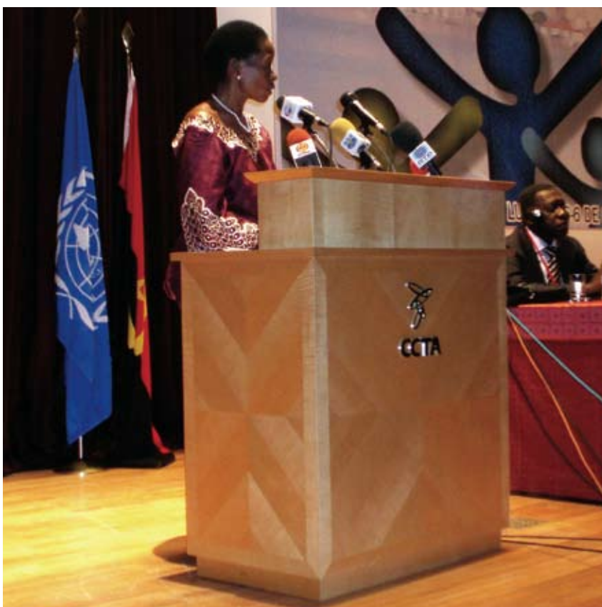
UN-HABITAT Executive Director, Mrs Anna Tibaijuka during the 2008 World Habitat Day celebrations in Luanda, Angola.

“Mr. President, I do not have to tell you that 85 percent of the Angolan population representing some 7.5 million of this country’s growing number of urban dwellers live in slum conditions. For a country rich in natural resources, especially oil, we are sure that the means are there to address these needs now that this country has earned its rightful place as a country at peace,” Mrs. Tibaijuka