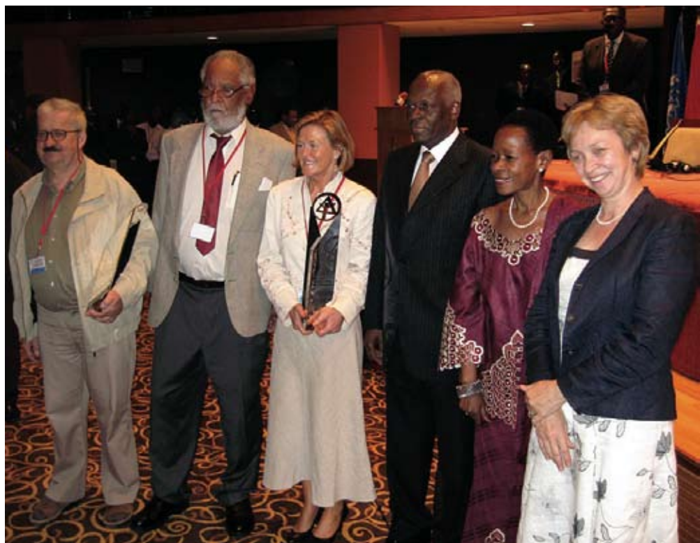
World Habitat Award 2008 winners.

Mrs. Tibaijuka also conferred the World Habitat Day awards. She said it was not by coincidence that this year, for the first time, the highest award conferred by the United Nations system in this field – the Habitat Scroll of Honour Special Citation – went not to an outstanding individual, but to a Chinese city, Nanjing. At the next level, the cities of Shaoxing and Zhangjiagang were given the Habitat Scroll of Honour Award, along with the Rwandan capital, Kigali, the Tatarstan