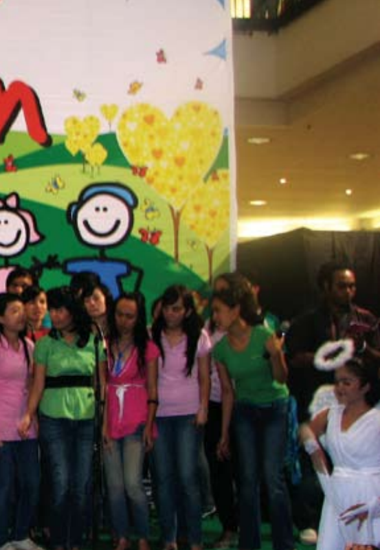
World Habitat Day celebrations in Indonesia.

association released a newsletter focusing on best practices in the urban sector and organised a discussion on the theme, Harmonious Cities . It developed a background paper, literature and case studies for dissemination among members, officers of local authorities, senior government officials, citizens, politicians, non-governmental organizations, local urban experts and media representatives.