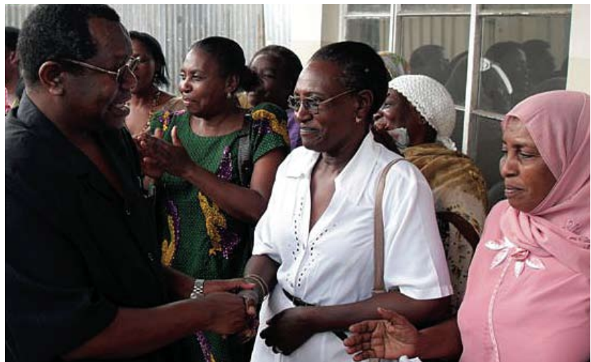
World Habitat Day celebrations in Tanzania.

Emergency Architects Australia organised the World Habitat Day events to run alongside the World Architecture Day and The Sydney Architecture Festival. The celebrations held at Customs House, Circular Quay, Sydney, were