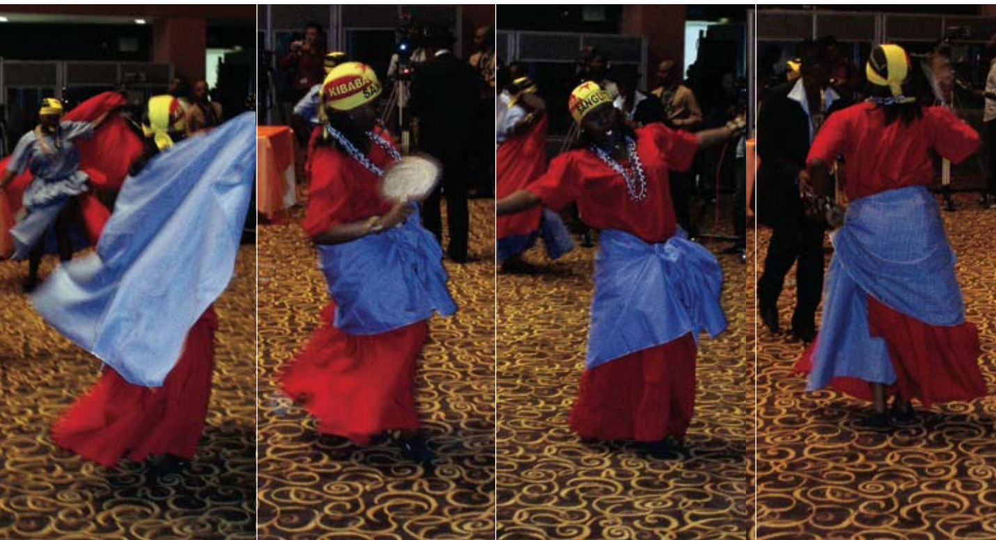
World Habitat Day celebrations in Angola.

In UN-HABITAT's home country, Kenyans celebrated World Habitat Day against the backdrop of traditional pomp and glamour provided by bull fighting teams in Kakamega, the provincial headquarters of Western Province.