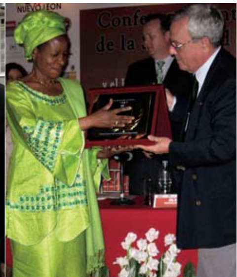
Pervious Habitat Scroll of Honor winners.

The Cooperating Committee for Japan Habitat Fukuoka Office (Special Citation), Japan