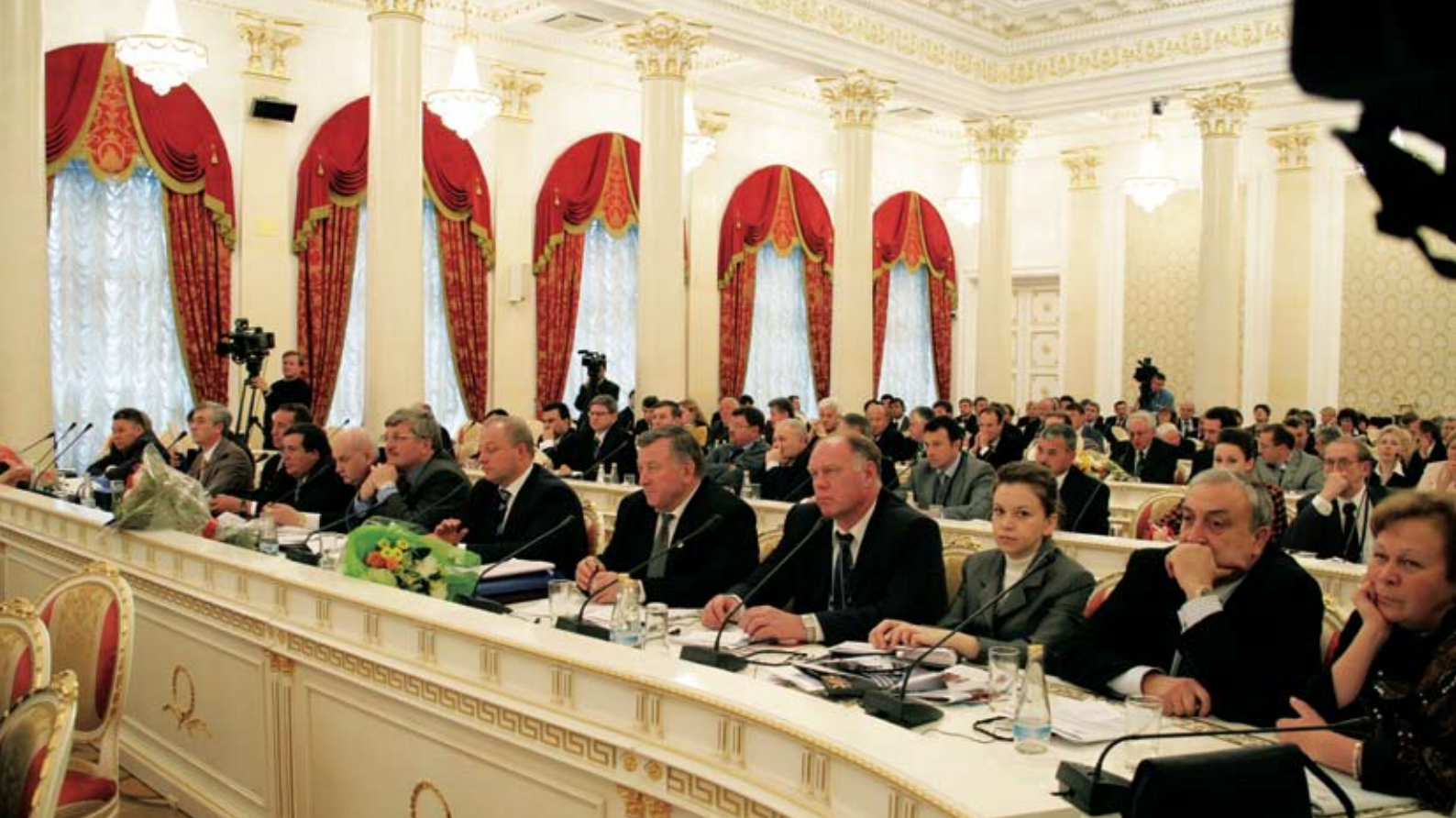
The 2006 World Habitat Day celebrations, the Hague, Netherlands.

Housing Development Administration, Turkey