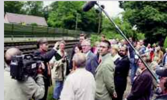
The Petitions Committee during an on-site visit to Verden-Dauelsen

The Petitions Committee has various options when it seeks to comprehensively clarify the facts of a case.