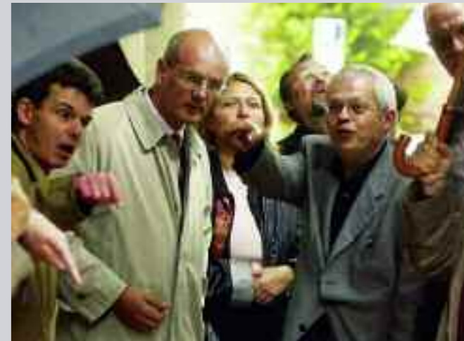
The Petitions Committee during an on-site visit to Castrop-Rauxel