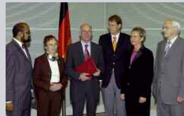
The report on the Committee's work is presented to the Bundestag President

other cases, it is necessary for the Committee to facilitate complex proceedings during which all parties can be heard (e.g. when making on-site visits). Frequently, ways of finding a solution become apparent to those concerned during this process. Against this background, it is to be noted that in previous years it has been possible to achieve something for the petitioner in almost half of all cases. This may not always be the solution originally requested by the petitioner, but often a compromise that is regarded as acceptable by all the parties.