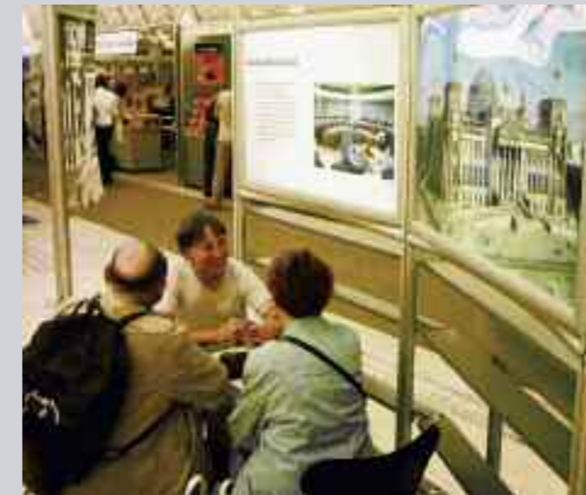
Meeting the public at trade fairs

For understandable reasons, the Petitions Committee does not deal with anonymous or insulting letters.