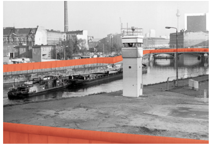
The Wall in 1985, view to the north from the Reichstag Building (above)