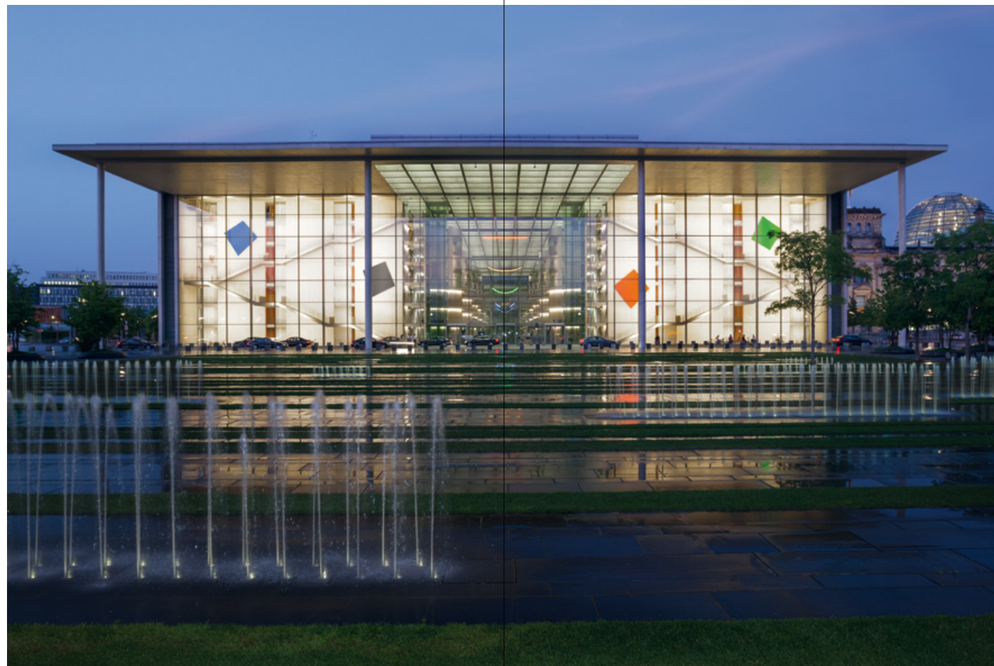
Berlin Panels 2000 , four coloured aluminium panels, 1998–2001, west facade of the Paul Löbe Building

Ellsworth Kelly is one of the best-known artists associated with 'hard-edge painting'. In 2013, he was awarded the National Medal of Arts by President Barack Obama. This level of appreciation is reflected, too, in the fact that he was asked in 2008 to create a 12-metre-high stainless steel column for the central courtyard of the US Embassy in Berlin – the Berlin Totem . Ellsworth Kelly also created a prominent installation for the German Bundestag: the Berlin Panels 2000 . These four aluminium objects in blue, black, red and green are plainly visible through the glazed west facade of the Paul Löbe Building, where the clearly delineated colour fields strike a distinctive note.