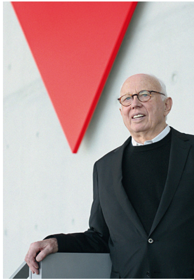
Ellsworth Kelly, born in 1923 in Newburgh, Orange County, New York; died in 2015 in Spencertown, New York