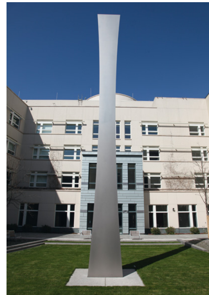
Berlin Totem , 2008, courtyard of the US Embassy in Berlin